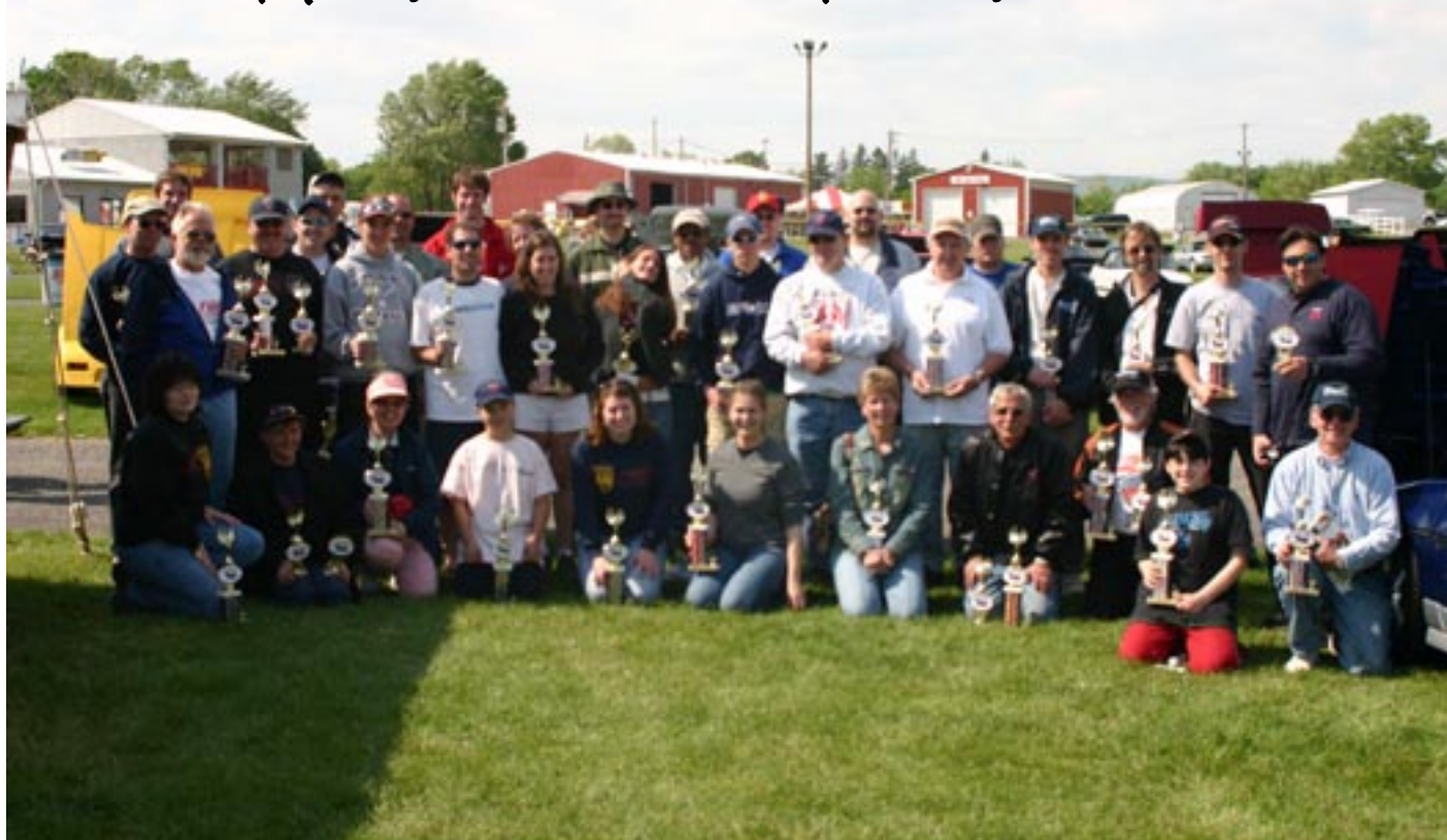
Trophy winners pose for pictures at Fieros at Carlisle '06