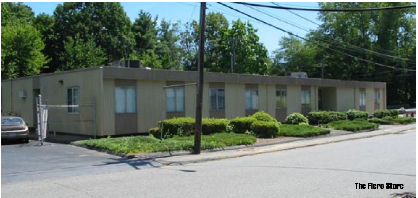
The Fiero Store