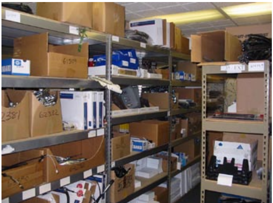
The Parts Department