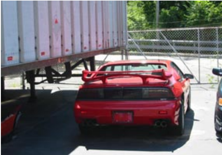
The 87 GT test mule