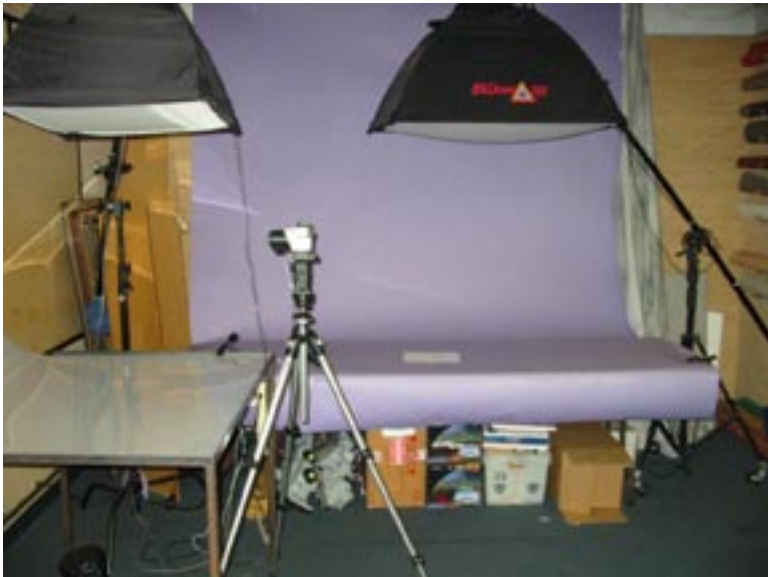
The Photo lab