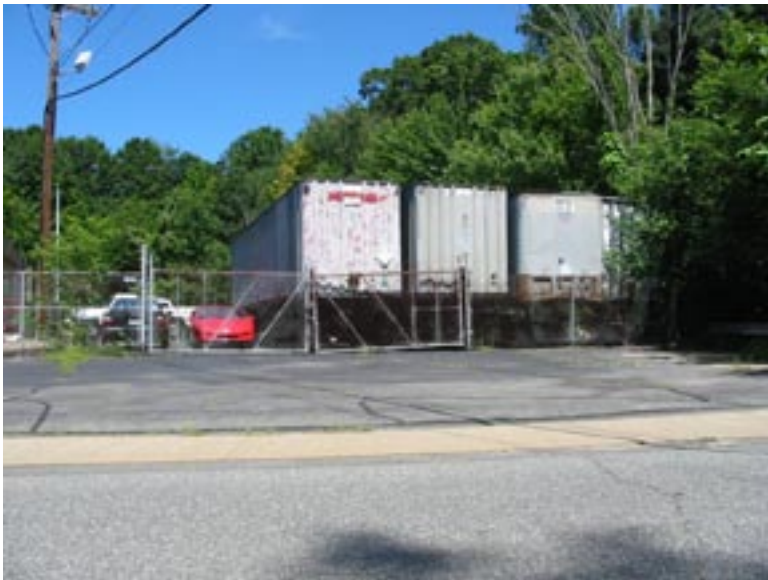
Trailers to store overstock