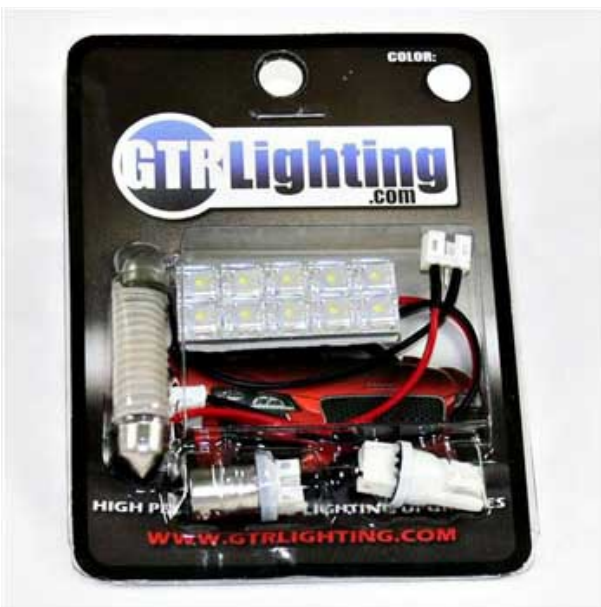
LED front GTR lighting 10-LED